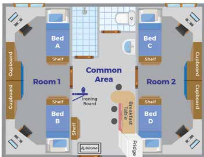
[OCDT] Dual Key - Twin Rooms

Note : Layout shown above are for illustration purpose only. Actual room layout may vary.