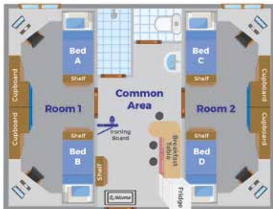
[OCDT] Dual Key - Twin Rooms

Note : Layout shown above are for illustration purpose only. Actual room layout may vary.